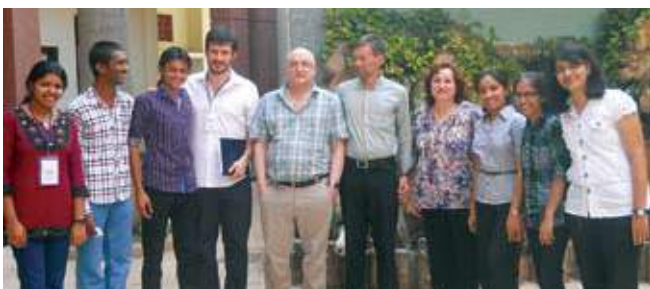
SMBS Students @ MDI Gurgaon

Accordingly meritorious students of SMBS are given an opportunity to attend International Summer University Programme at MDI, Gurgaon for two months. Through such initiatives, SMBS, M G University aims to provide a cross-cultural exposure and a global perspective to the students.